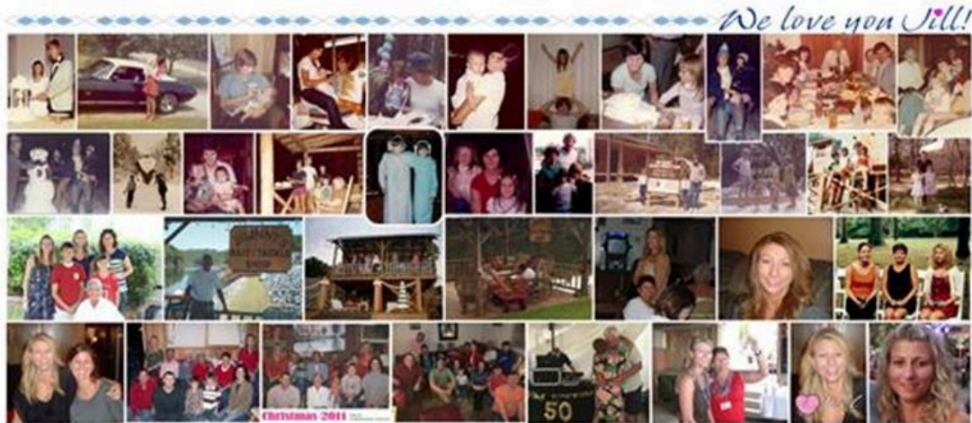
Here's some favorite moments... going back to start for this wonderful family.